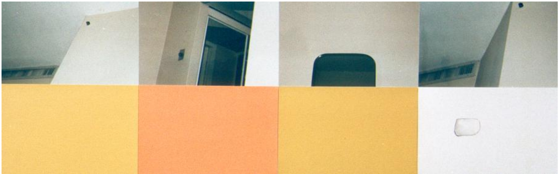
"PASSING NR. 2", 2000, 100 x 280 cm (4-teilig) Besitz Kunstmuseum Bonn