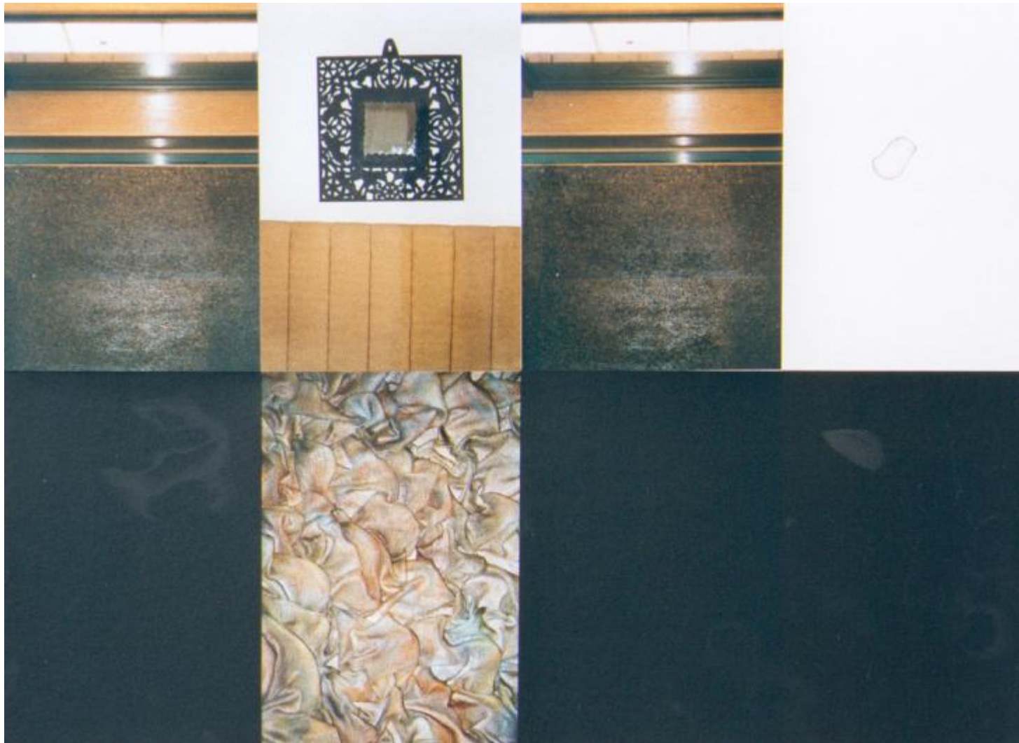
"PASSING NR. 18", 2000, 60 x 80 cm